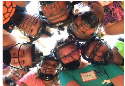
Many players do not own facemasks and may not be able to afford them. SIS provides free facemasks to players and teams that can't afford them. SIS also supports SMART*

* For information about SMART (Softball Mask Awareness and Rules Team) please go to www.pleasewearamask.com .